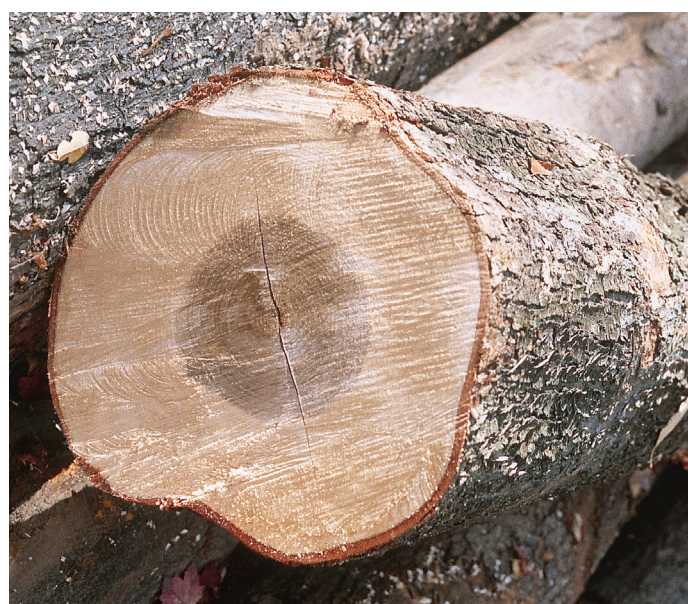
AHEC highlights the value of a "risk-based" approach

AHEC has consistently highlighted the value of a "risk-based" approach to provision of assurances of legal and sustainable timber sourcing, particularly when dealing with products from non-industrial forest owners or composite products for which it is not possible to trace fibre back to specific forest management units.