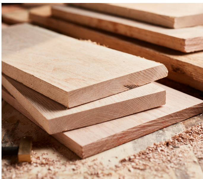
Systems like FSC easy to manipulate as they rely on annual paper-based audits