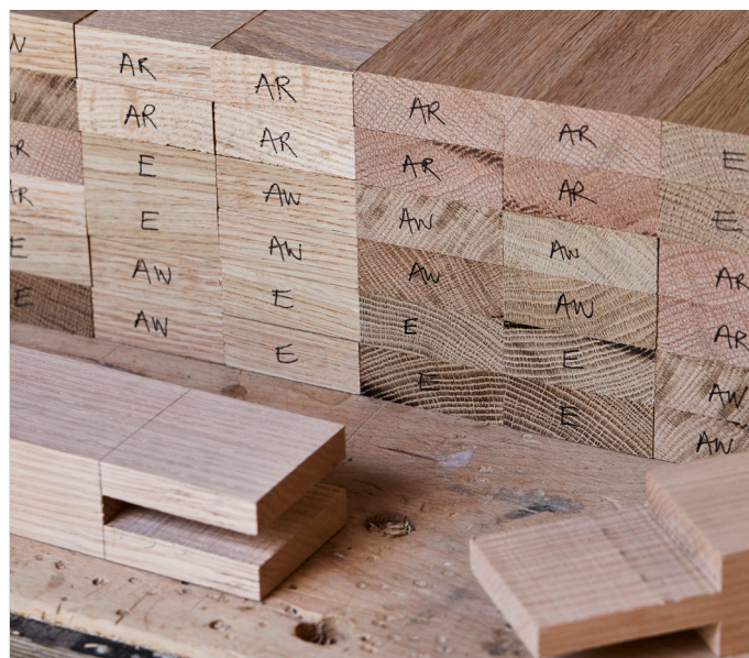
All data used for AHEC's online tools were drawn from verifiable resources

The LCA study of the cradle-to-gate environmental impacts of delivering U.S. hardwood lumber and veneer into export markets was prepared by Thinkstep (formerly PE International) in 2012 in compliance with the ISO 14040/44 standards for LCA. Thinkstep is a global leader in Sustainability Performance Management and provides the world's largest and most accurate sustainability databases.