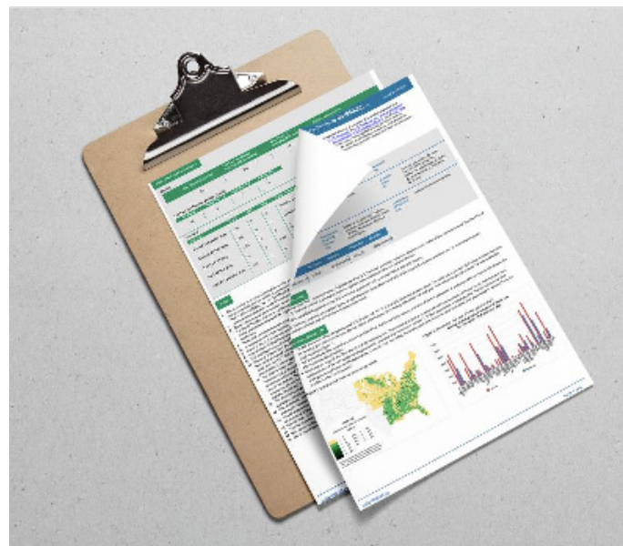
The AHEP system provide AHEC members with species-specific data

reported for EUTR and similar regulations, alongside sustainability data from the FIA, the LCA and the Seneca Creek Assessment, to their overseas customers. AHEPs can be issued by AHEC members either for the term of an individual supply contract or for individual consignments of U.S. hardwood exported by AHEC Members to anywhere in the world.