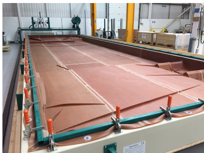
CLT panels under load in the vacuum press

The CLT shall be moved or processed in a way that the post-curing process is not affected by