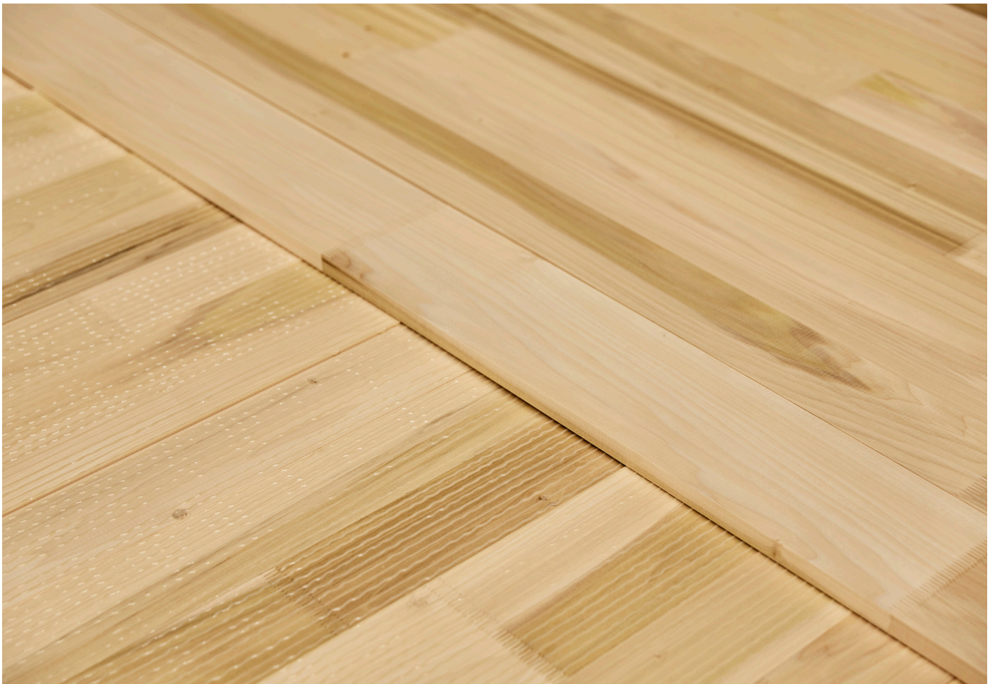
Close-up of tulipwood CLT panels

The baseline material of tulipwood has enhanced properties as compared to softwood normally of C24 grade, which is used most typically for the European manufacture of CLT. This enhancement is reflected when comparing CLT to European manufactured softwood CLT, with the exception of flatwise bending. However, the performance of the CLT within this study will be influenced by the characteristics of the base material used for the actual panel fabrication. This is compounded further by the statistical analysis, itself influenced by the size and variability of