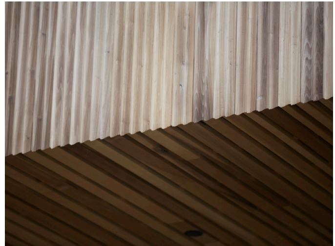
Thermally modified U.S. tulipwood cladding at Maggie's Centre

Thermally modified timber is timber which has been heated in a controlled setting to between 180°C and 210°C. This baking process effectively removes sugars and starches and hemicelluloses which in turn provides enhanced stability and durability and reduces shrinking and swelling over time. Thermal wood modification changes the appearance of the wood, giving it deeper brown tones throughout. Thermo treating significantly increases timber's water resistance and is already proven in hardwood cladding.