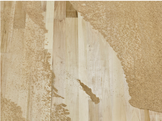
CNC-machined tulipwood panel

Glenalmond's premises in Perthshire to those of the Construction Scotland Innovation Centre in Blantyre, a 78 mile (125.5 km) / 1.5 hour journey. The speed of panel production possible in CSIC's vacuum press, together with the time required for the adhesive used in the manufacture of the CLT panels to cure, meant that the total volume of timber had to be delivered in batches on a daily basis, thus introducing an additional cost and time factor to the project.