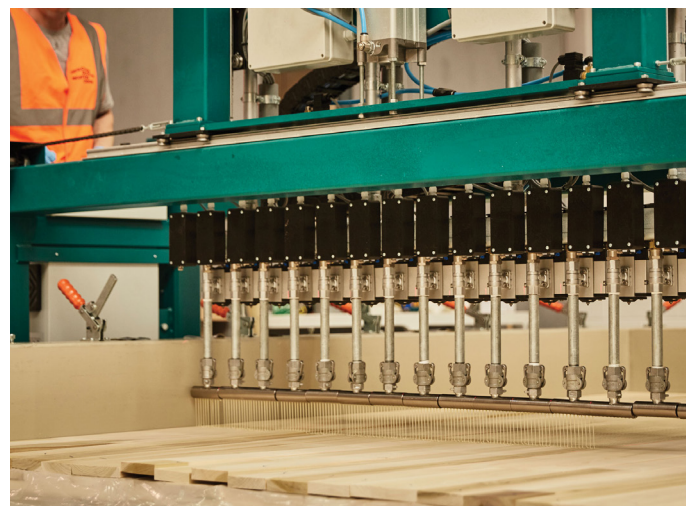
Application of adhesive during panel manufacture at CSIC

The timber moisture content must be no less than 8% and no greater than 15% to bond effectively