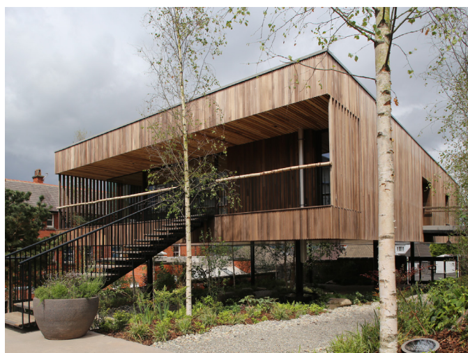
Maggie's Centre, by dRMM Architects, Oldham, 2017

As with The Smile , the 20 five-ply panels - ranging in size from 0.5m to 12m long - were produced in Germany by Züblin. For AHEC, Maggie's Centre represented a milestone in almost a decade of innovative research and development into the structural potential of hardwood: the demonstration that U.S. tulipwood CLT was capable of being manufactured on a commercial