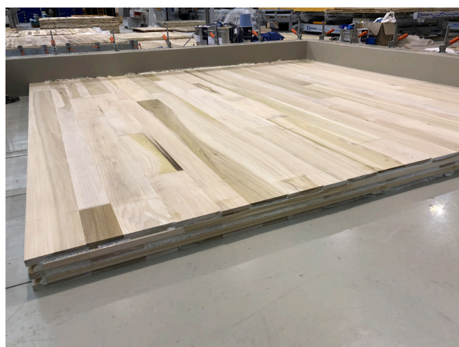
CLT panels in press after assembly time has elapsed

After pressing, panels must be stored at a temperature of approximately 20°C for at least 10 hours