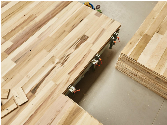
CLT panels in storage after removal from press