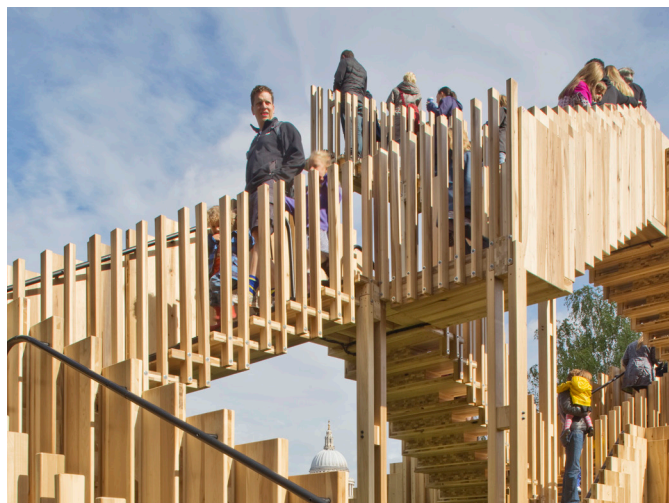
Visitors exploring Endless Stair at London Design Festival 2013

Imolalegno in Italy fabricated the 187 CLT steps and balustrade elements and Nüssli in Switzerland put them all together, forming the final structure which was erected on site in front of the Tate Modern on the South Bank of the Thames, structural testing having previously been carried out by Trento University. The resulting sculptural installation was as visually challenging as it