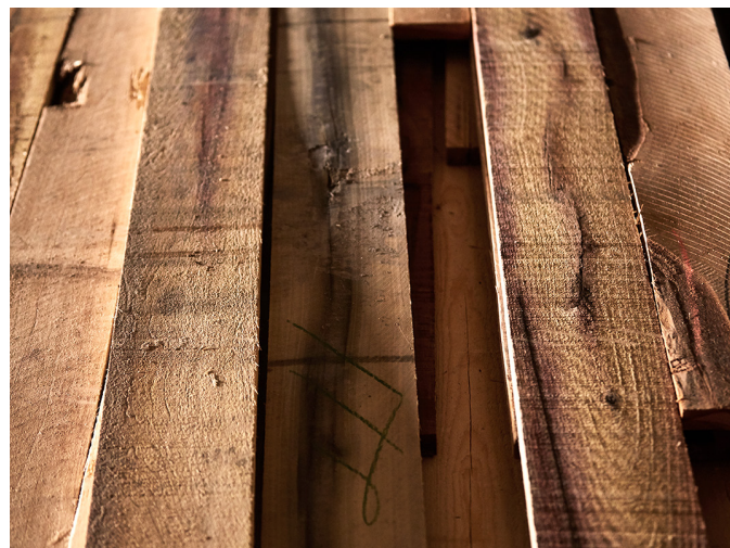
Tulipwood prior to processing

The tulipwood for the MultiPly project was supplied to AHEC from a number of timber donors in the east of the USA and shipped to Scotland.