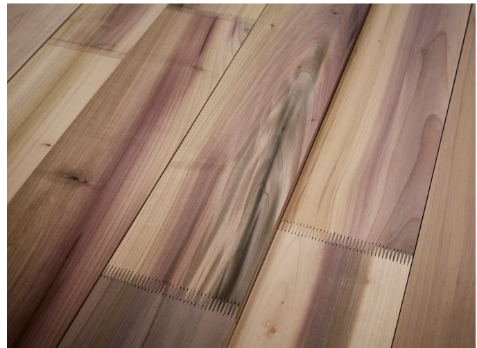
Tulipwood after fingerjointing and planing

The range of moisture content between adjacent laminations bonded together parallel to the fibre shall be not greater than 5 %.