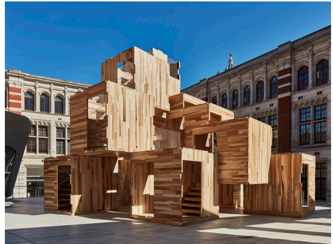
MultiPly, by Waugh Thistleton and Arup for London Design Festival 2018

In 2018, AHEC demonstrated a project even more ambitious than before: a three-storey, three-dimensional maze, named MultiPly , designed by Waugh Thistleton Architects and engineered by Arup for London Design Festival 2018. The challenges were threefold: first to develop a system of load-bearing hardwood CLT panels and connections which are sufficiently strong and stable to support the large numbers of people traversing the installation at any one time; second, to deliver a structure that can be dismantled and re-used after the festival; and third, to fabricate the entire installation in the UK. This last issue was perhaps the most problematic to resolve within the timescale available, given that - at the point of the project's initial conception by Waugh Thistleton Architects and Arup engineers - no capacity existed in this country to actually manufacture the innovative panels required. Fortunately, the Construction Scotland Innovation