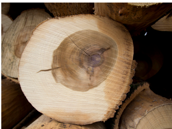
Logs of U.S. tulipwood