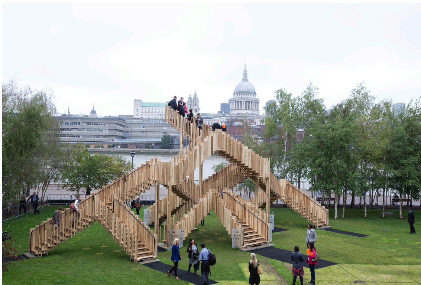
Endless Stair , by dRMM Architects and Arup for London Design Festival 2013

was technically and, importantly, was the first significant public demonstration of the cross lamination potential of U.S. tulipwood.