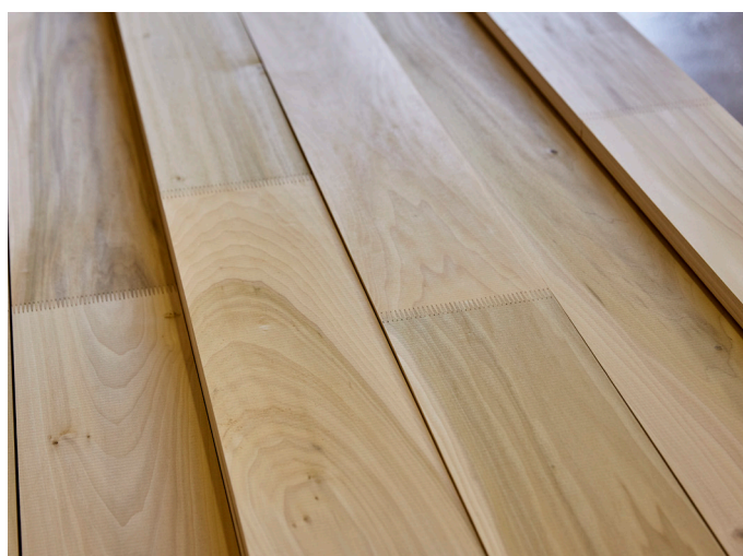
Boards of U.S. tulipwood

The use of hardwood timber species for the production of CLT represents a great opportunity for the implementation of Solid Laminate Timber Systems and for the development of under-