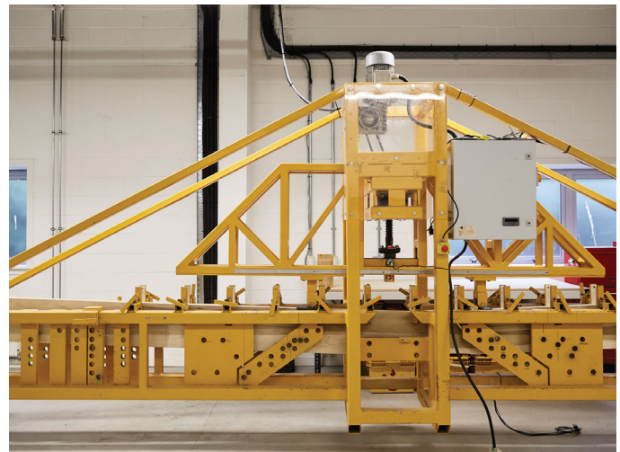
Edgewise bending testing at Edinburgh Napier University

The properties of tulipwood CLT derived in this study provide benchmark information for CLT