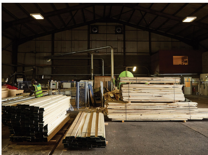
Tulipwood being processed at Glenalmond Timber, Perth

At this stage, Edinburgh Napier University also undertook a range of structural testing on a sample range of fabricated panels, in accordance with EN 16351 , comprising bending strength and stiffness, rolling shear, tension and bonding strength to verify the structural properties of tulipwood CLT.