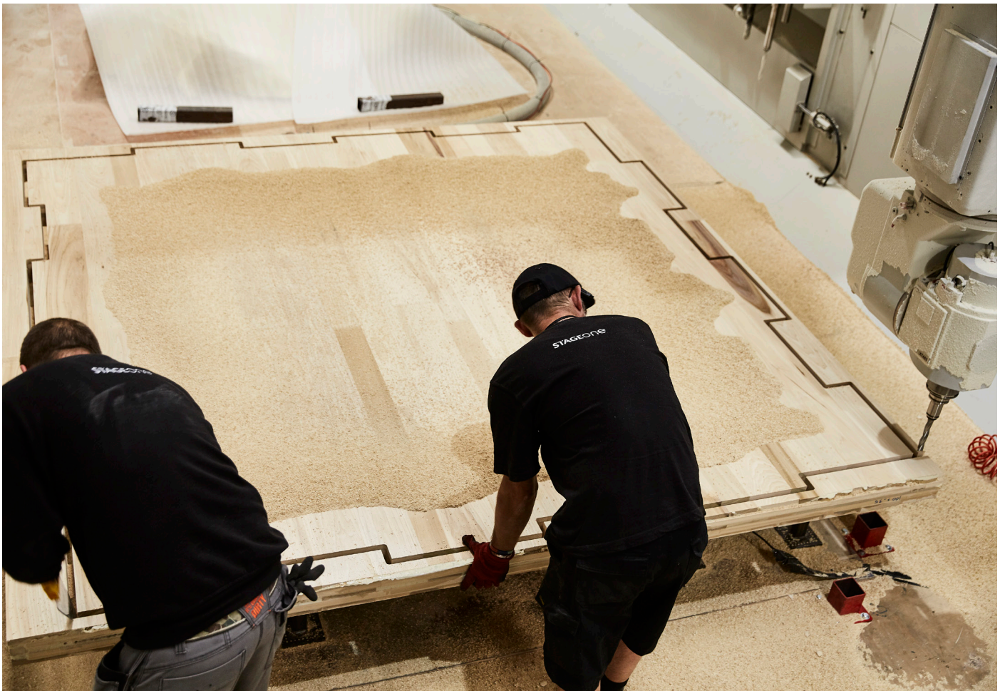
CNC machining at Stage One, York