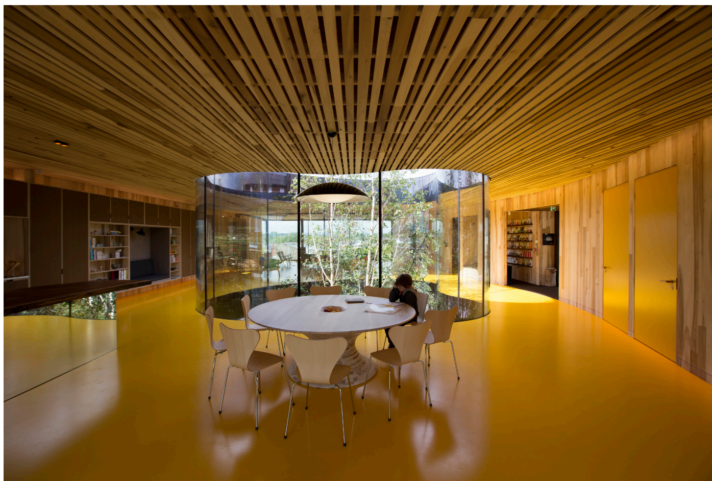
Maggie's Centre, Oldham, interior

scale for a project with a very tight budget. The use of U.S. tulipwood CLT by the construction industry was now apparent for all to see.