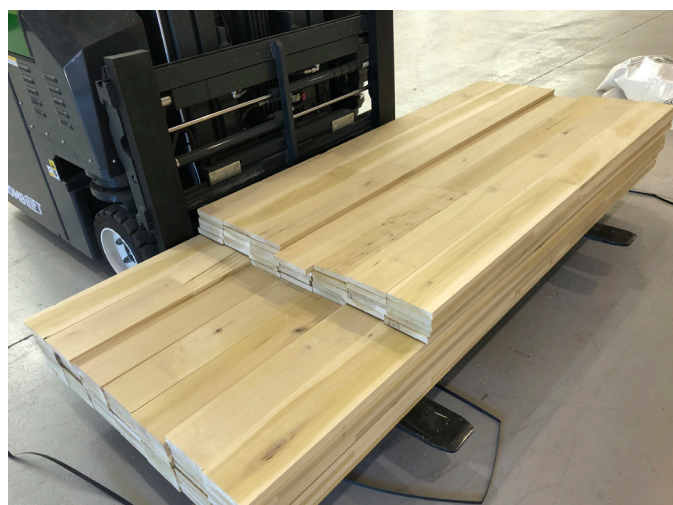
Tulipwood upon arrival at CSIC

Upon arrival at Construction Scotland Innovation Centre the moisture content and timber temperature of a sample range of timber was checked and recorded.