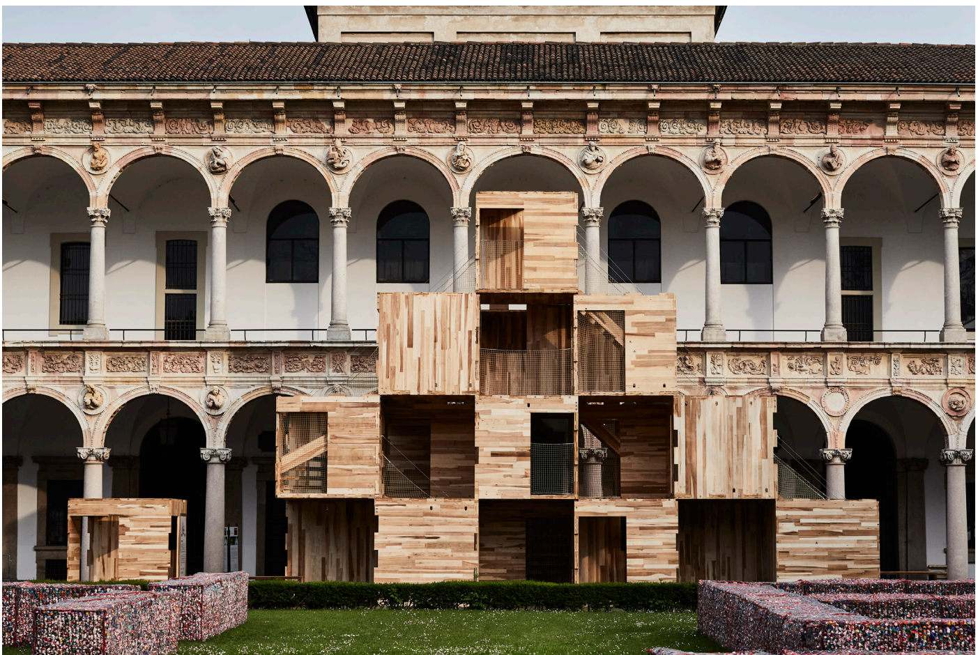
MultiPLY at Milan Design Week, 2019

Its third location saw the pavilion travelling across the Channel to Milan for Interni magazine's Human Spaces exhibition, as part of Milan Design Week. Its new inception in Italy showed how easily it could be reconfigured to meet the users' needs.