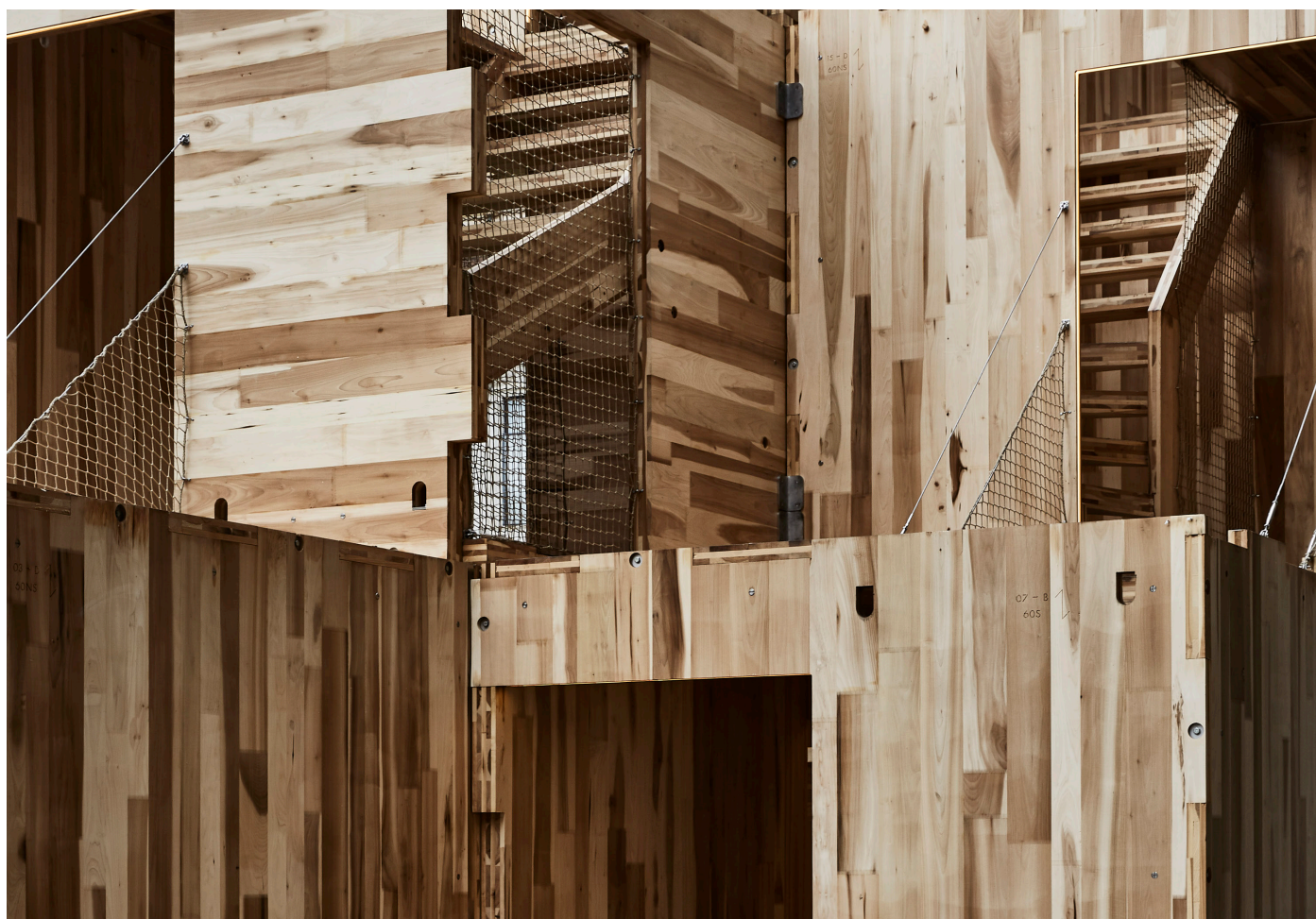
Tulipwood CLT panels of MultiPly at its third iteration in Milan 2019

In addition to the above tests, 20 bending tests of a sample range of individual lamella previously assessed by means of acoustic characterisation