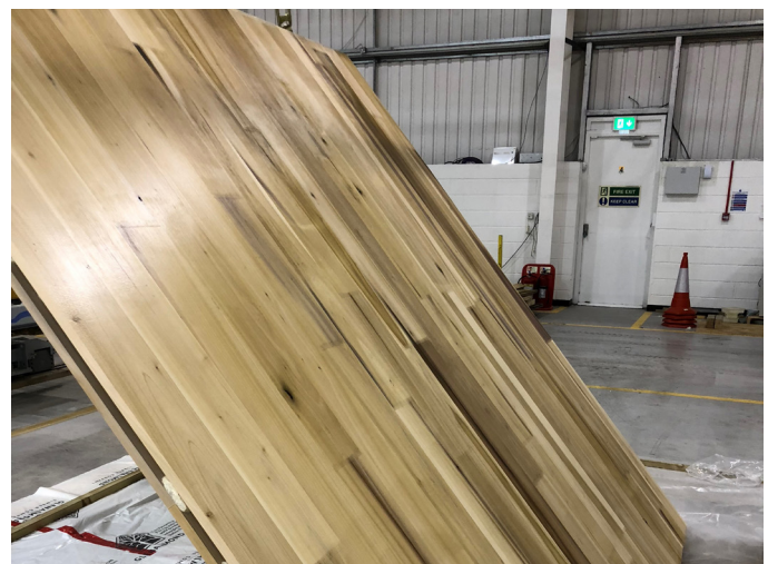
CLT panel sanded and lacquered

Tulipwood can be readily sanded and prepared. The lacquer applied required no additional curing time or special surface preparation specific to tulipwood. There were no additional special conditions or requirements where this was concerned.