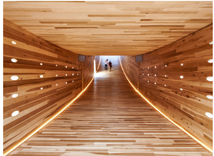
Interior of The Smile

The Smile's spectacular 3m high, 4.5m wide and 34m long, curved box was formed from a series of panels 4.5m wide, 12m long using long self-tapping screws and stainless steel plates to make the connections. The Smile represents the first-ever use of industrial-size hardwood CLT panels,