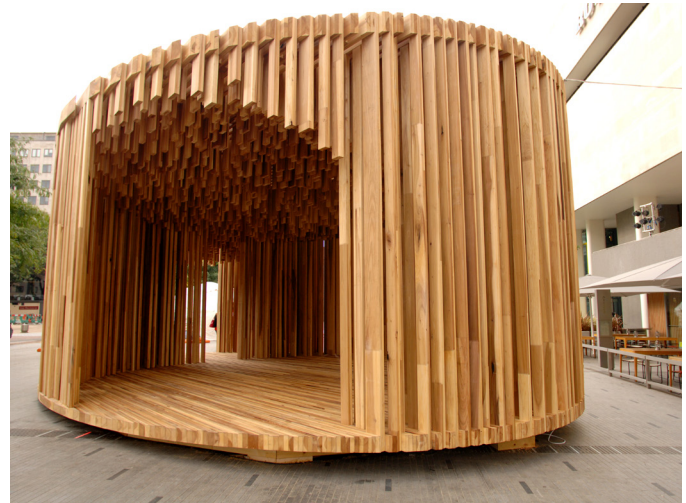
Sclera , by Sir David Adjaye, on display outside the Southbank Centre for London Design Festival 2008

Developing the idea of cross laminated timber panels made from U.S. tulipwood has been something of a step-by-step process. Initially in the construction of Sclera , an elliptical pavilion designed by Sir David Adjaye for London Design Festival 2008, which was formed using laminated tulipwood. The project aimed to emphasise the long, relatively knot-free, timber sections possible from this species, rather than for any particular structural innovation likely to emerge from the use of this material. Adjaye chose U.S. tulipwood for Sclera for its unusual colouring. It was only afterwards that ideas began to emerge to capitalise tulipwood's anomalous (for a hardwood) low density characteristic in the production of solid laminated timber products.