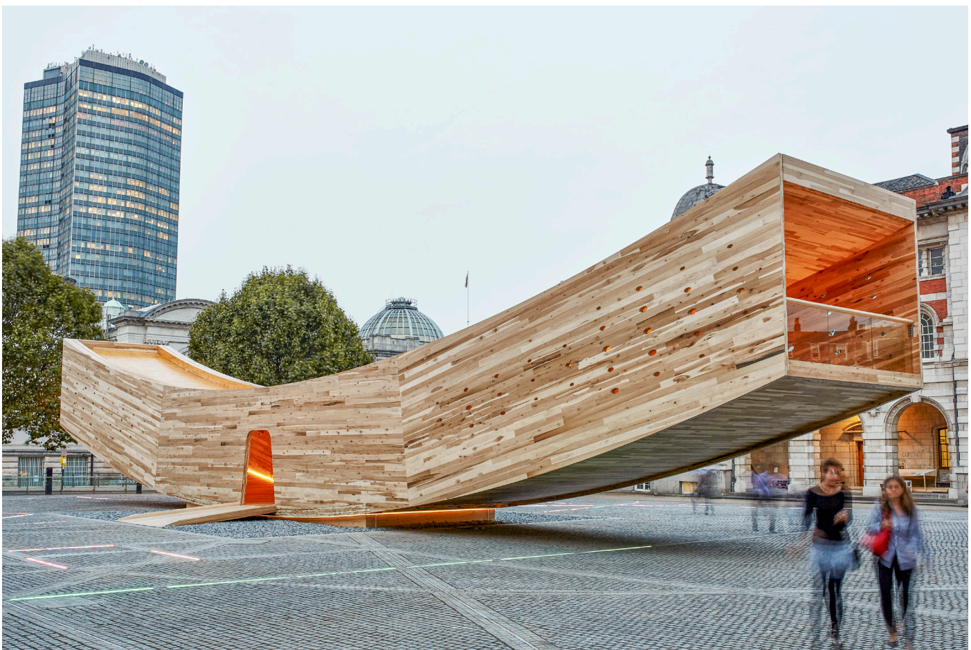
The Smile, by Alison Brooks Architects, for London Design Festival 2016

manufactured specifically for the project by Züblin in Germany.